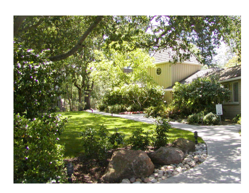
Existing outdated structures are surrounded by beautiful large heritage trees.