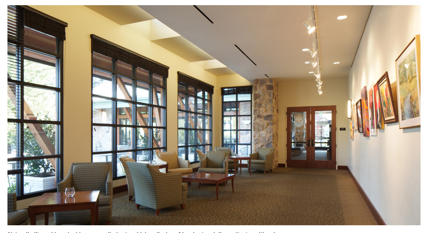
Naturally-lit corridors double up as galleries to which a display of local artwork livens the transitional spaces connecting major activities and functioning areas of Creekside Clubhouse.

To its north end, Creekside Complex also supports a 12,312-square-foot equipment barn with security, storage, maintenance offices, and an EMT (Emergency Medical Technician) room. The barn designs carry a simplified contemporary aesthetic consistent with the other complex buildings.