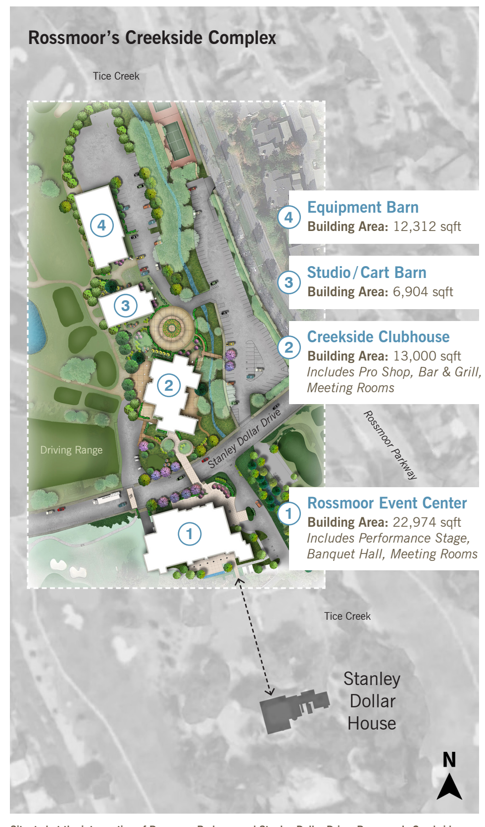
Situated at the intersection of Rossmoor Parkway and Stanley Dollar Drive, Rossmoor's Creekside Complex is at the heart of the 1,800-acre gated, senior living community.

DAHLIN GROUP ARCHITECTURE | PLANNING WWW.DAHLINGROUP.COM ROSSMOOR CLUBHOUSES