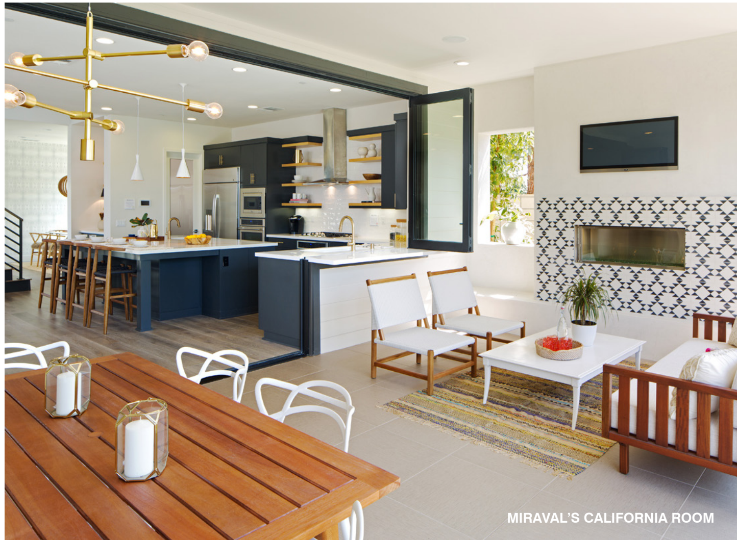
MIRAVAL'S CALIFORNIA ROOM