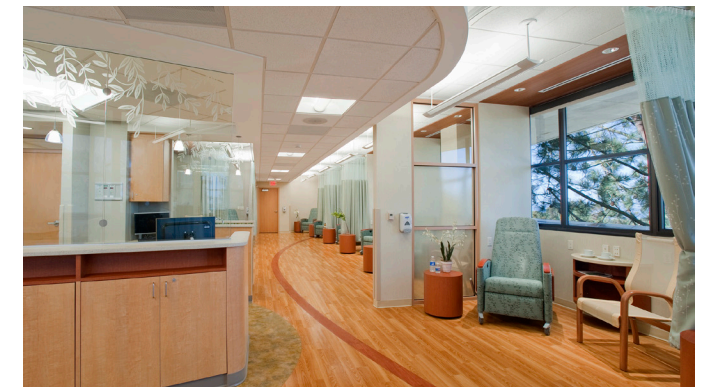
Patient stations maximize outdoor views in an open-bay concept supported by a curtain wall track system that provides psychological spaciousness and patient privacy within an open floor plan.