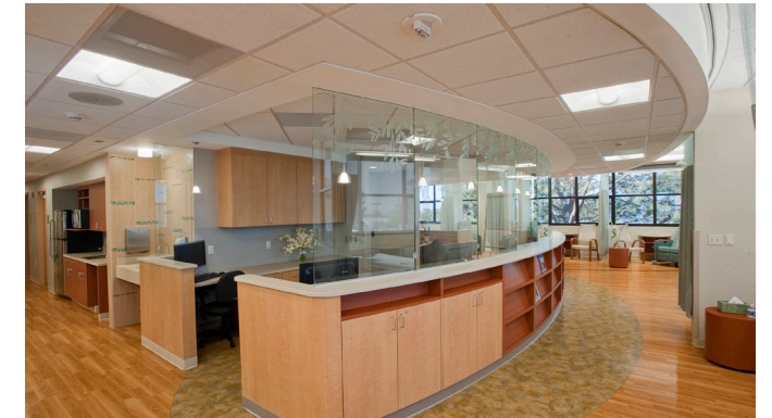
Circulation surrounding a centralized nursing station improves visibility with quick and direct access to patient bays.

For media inquiries: Colette Aviles , 925-251-7200