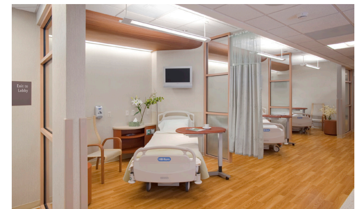
45-degree bay angles increase the efficient use of space, directional maneuverability, and patient privacy.