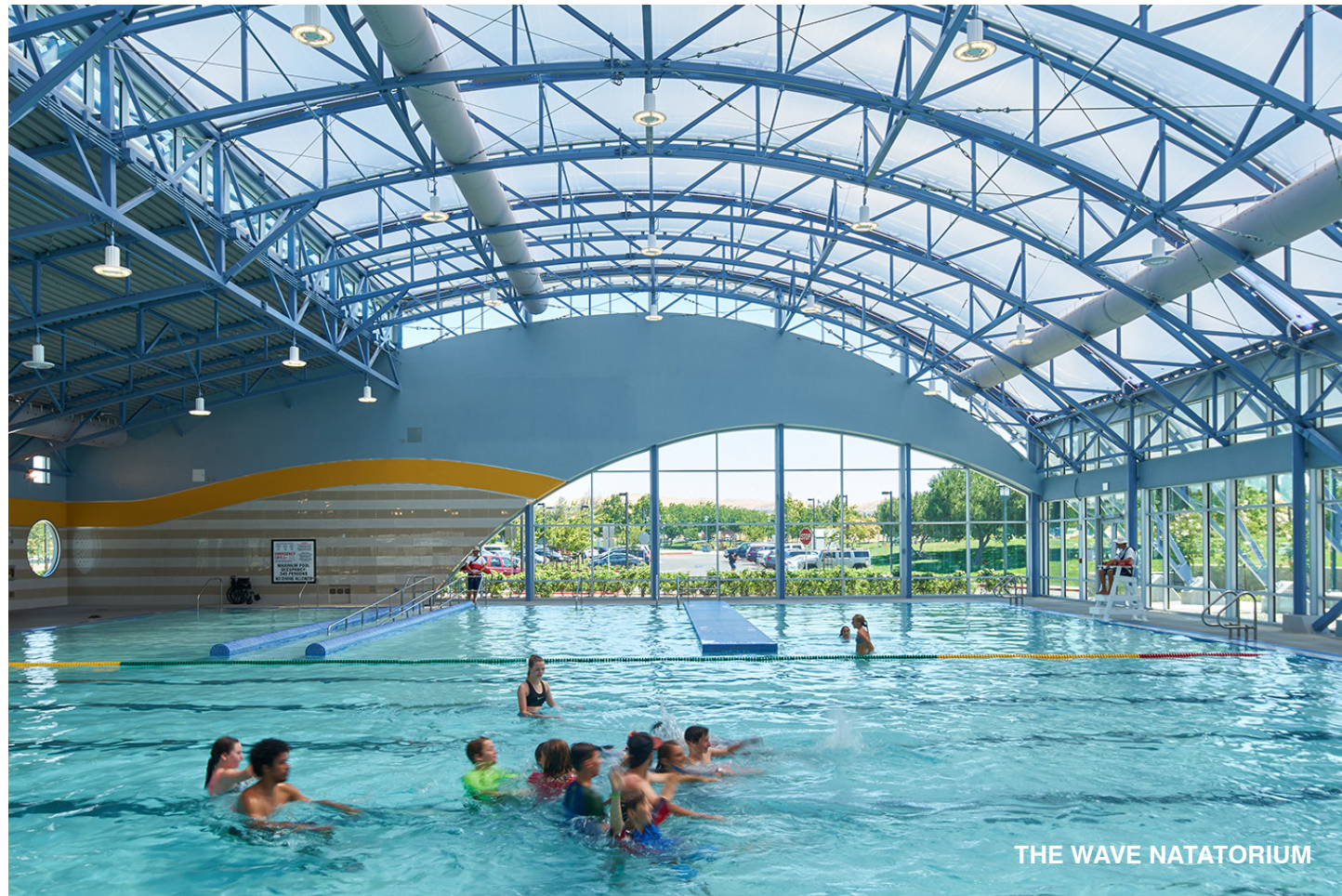
THE WAVE NATATORIUM